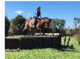
"Mistaken Identity" and owner Melinda Moore schooling X-C.

You provide your own horse and we will stable it overnight included in the Camp Fee (Self-care: your feed and our shavings). Entry fee in camp includes CT on Sunday. We encourage overnight camping for participants because of evening activities of a Friday Lecture, and Saturday Pot Luck Open Barn party! Electrical Hook-Ups at no extra charge. Daily camp itineraries, camp application, & releases can be found at www.prestigettraining.com . A non-refundable deposit of $100 is required with the application and the balance is due with release on the first day of camp.